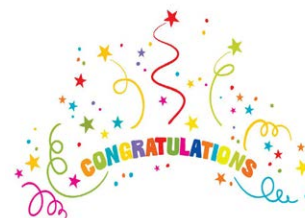
Cherry Hill High School West