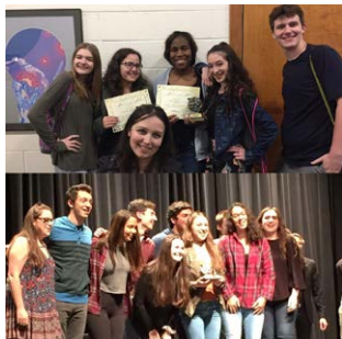
Drama Students from High Schools East and West Earn

Superintendent, Cherry Hill Public Schools