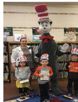
Cat in the Hat Visit