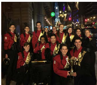
Cherry Hill East Drum Line