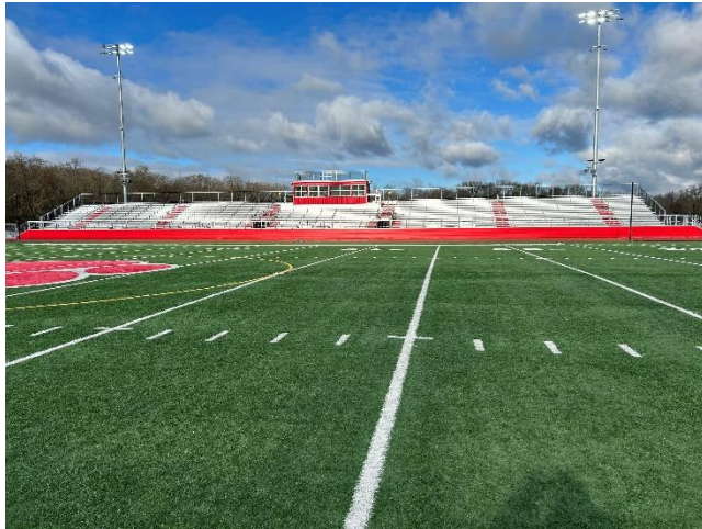
Press box and home bleachers