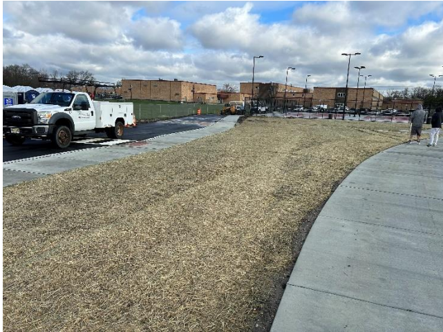
Sidewalks and seeded/stabilized lawn area