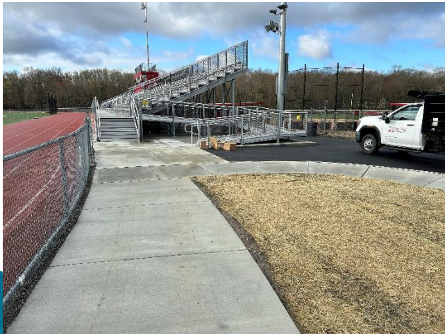
Home bleachers showing stairs and ramps