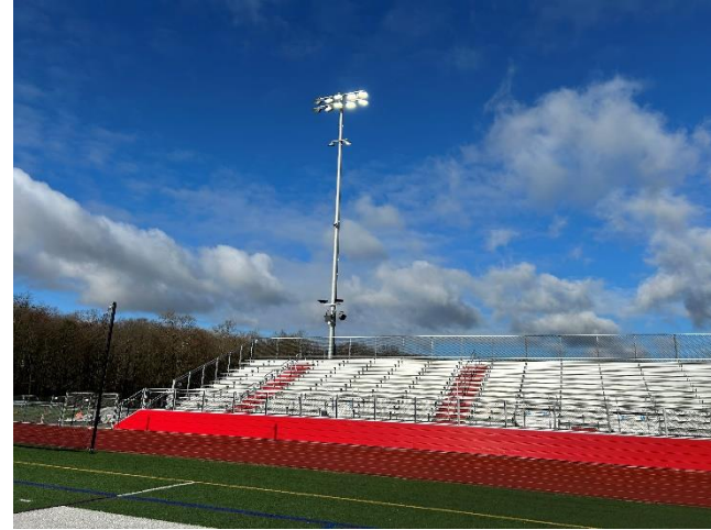
Home bleachers and sports lighting